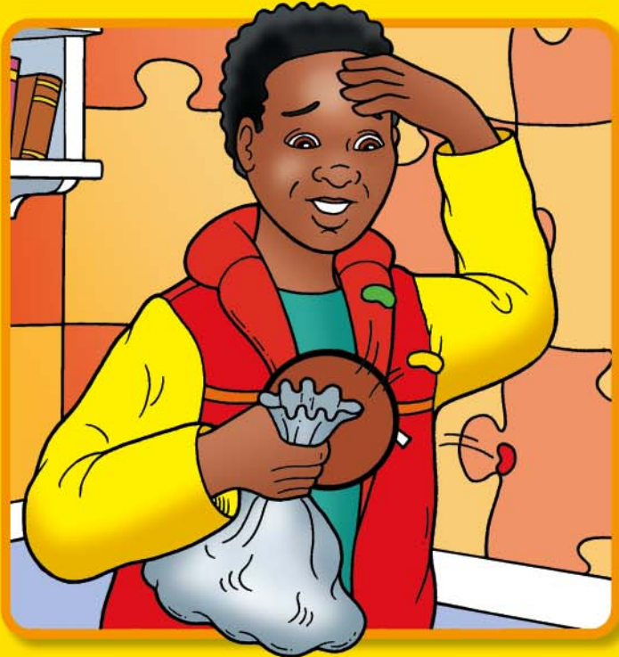
5. A paper bag doesn't work either.