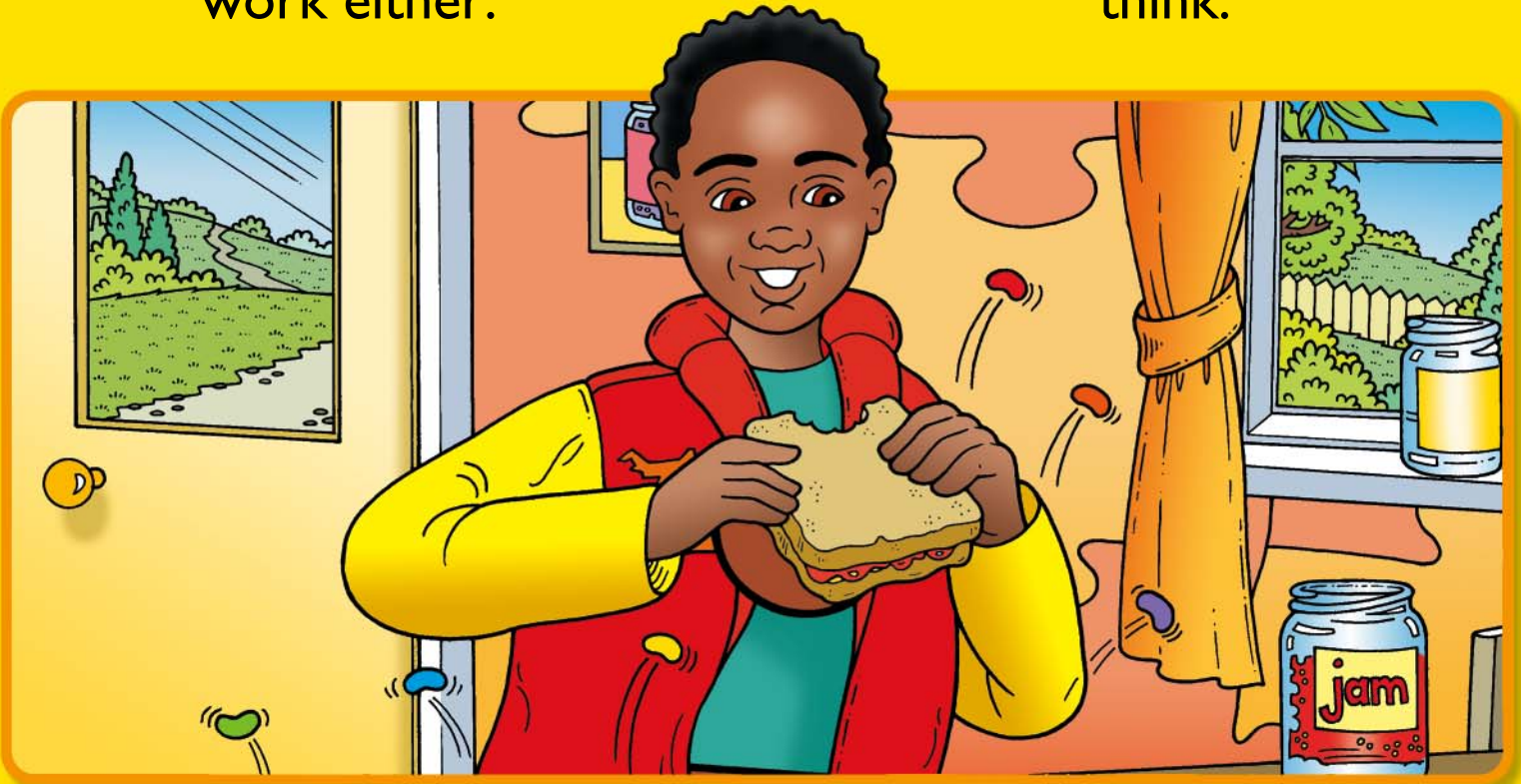
7. Ah, the jam jar! Now Jumping Jim has an idea.